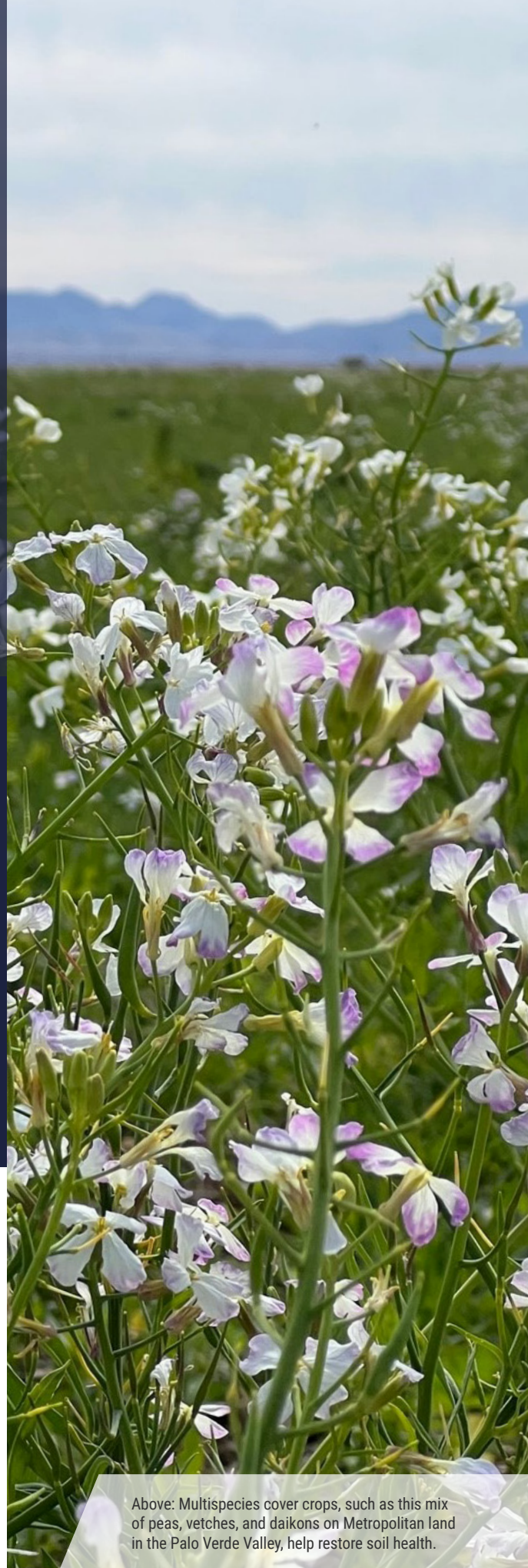
Above: Multispecies cover crops, such as this mix of peas, vetches, and daikons on Metropolitan land in the Palo Verde Valley, help restore soil health.