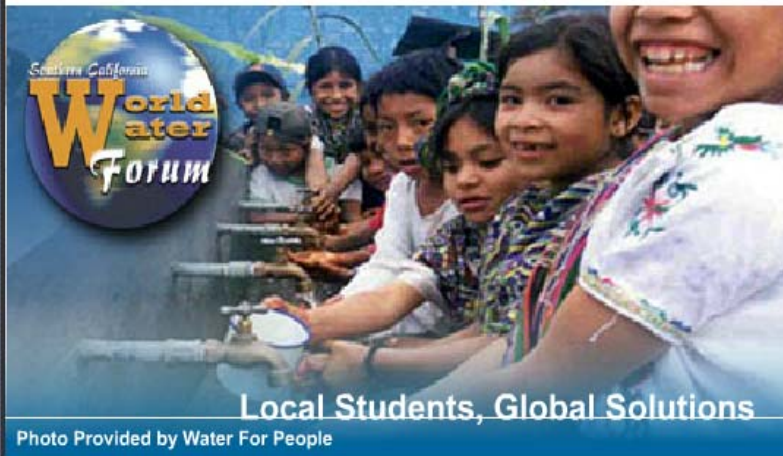
Local Students, Global Solutions